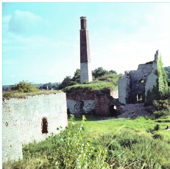
Brandy Bottom Colliery Historical Research Report

book details the restoration work carried out by the AIBT and the history of the Colliery. The site is a Scheduled Ancient Monument so all work there has to be authorised by English Heritage. The A4 book has 64 pages including colour front and rear covers. There are 53 figures including many photos and maps. The book has four appendices, one of which lists sixty references. A full review will be available later.