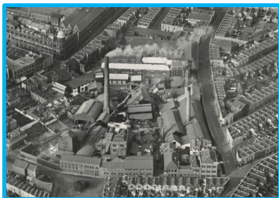
Aerial view of the works in 1921