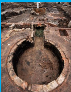
Chimney base in 2021