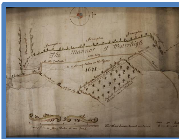
1671 Land Survey