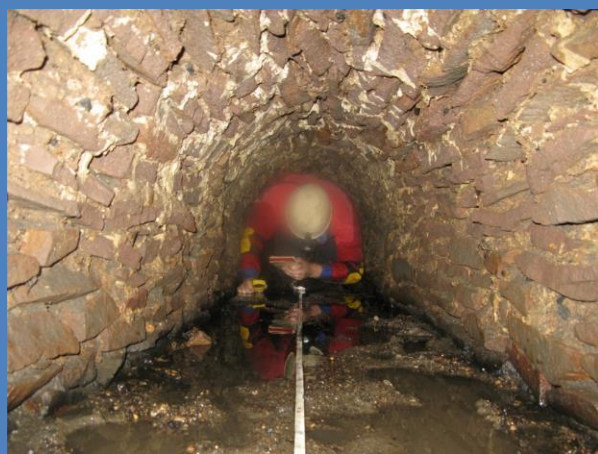
Surveying 1695 Drainage Tunnel

Non-members welcome - £2 each (cash please) (Membership is £20.00 per year, including talks and newsletters)