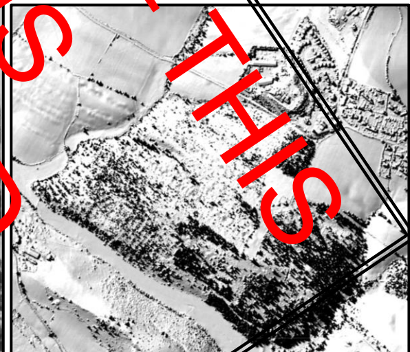
Clutton area Lidar scan

Non members welcome - £4 each for the walk (Membership is £20 per year (includes talks, walks and newsletters))